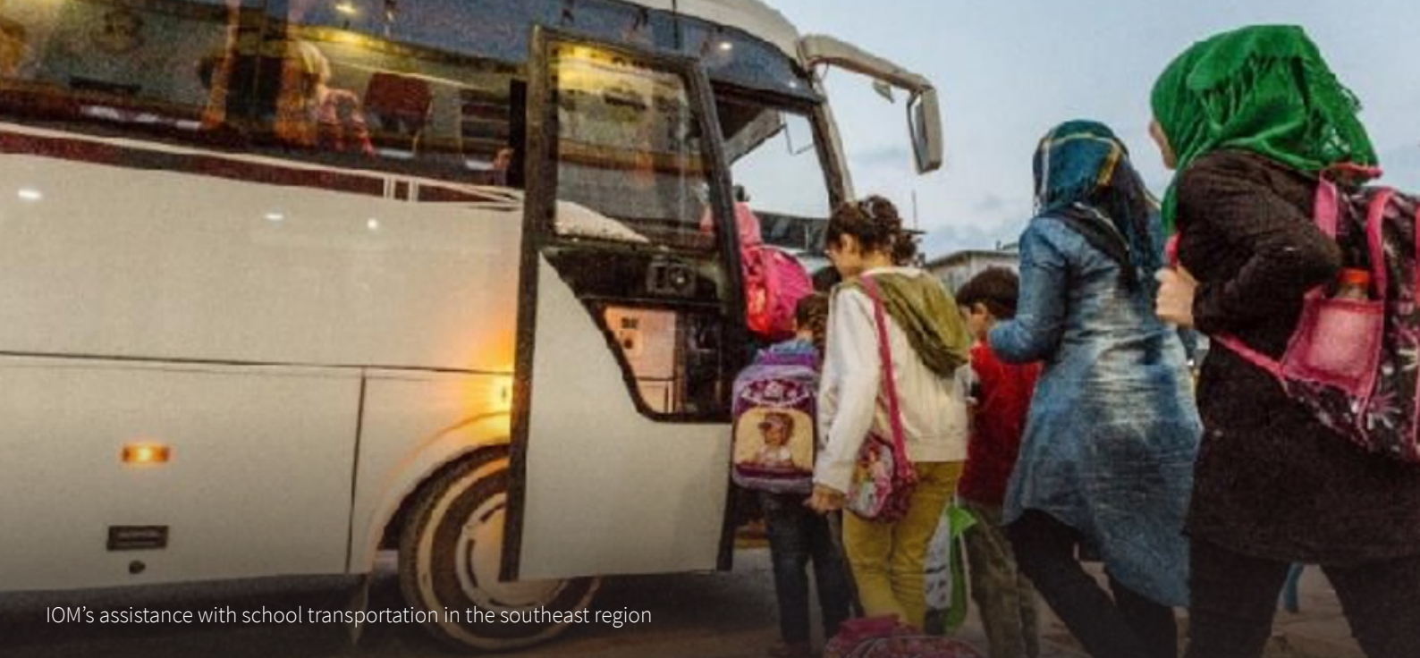
IOM's assistance with school transportation in the southeast region

quality, and define a sustainable exit strategy, ensuring every child can realize their potential through education.